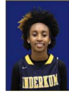
Week 8 Brooklyn Autri Girls Basketball