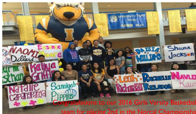
Congratulations to our 2016 Girls Varsity Basketball team for placing 2nd in the Norcal Championship